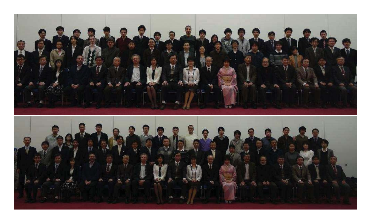
Figure 2: Group photos at the conference on the day.

earthquake. (I didn't ;-) At first we had a good news; almost all the people were safe because they were in front of you! Around 150 people are not few; we cannot take group photo once (Figure 2)!